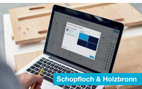
Schopfloch & Holzbronn